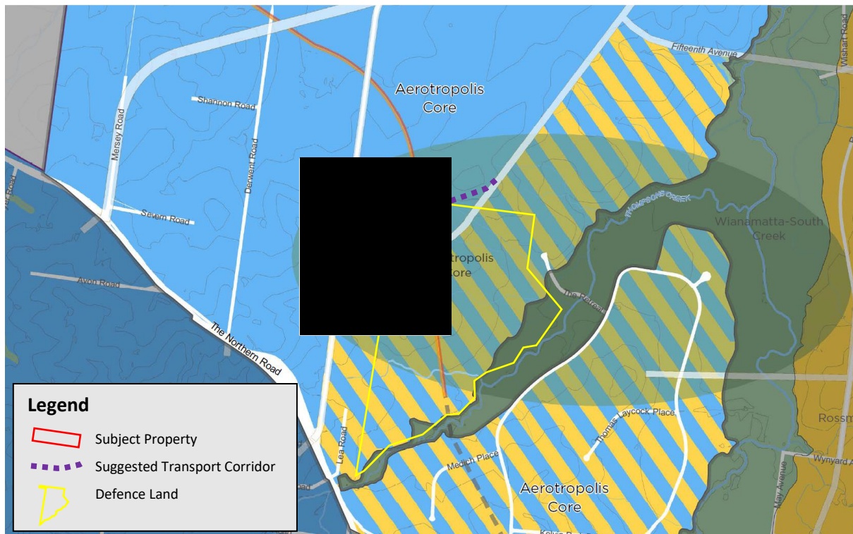
Figure 1: Subject property outlined in red in context of the draft Structure Plan – Aerotropolis Core